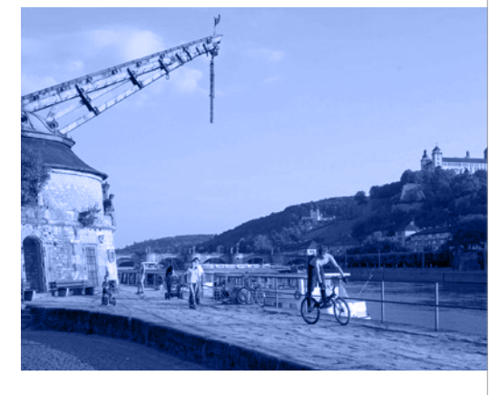
A view from the Old Crane of the Marienberg Fortress – the 4th largest fortress in Europe

Cost of living is relatively low and it is easy to find a student job. Students from the EU are permitted to work up to 20 hours weekly during their studies. Non-European students are allowed to work 120 days a year. Furthermore, there are various scholarships available. Please check with the DAAD (www.daad.de).