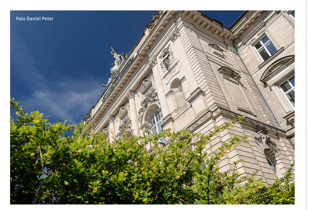
Faculty of Business Management and Economics in the heart of Würzburg