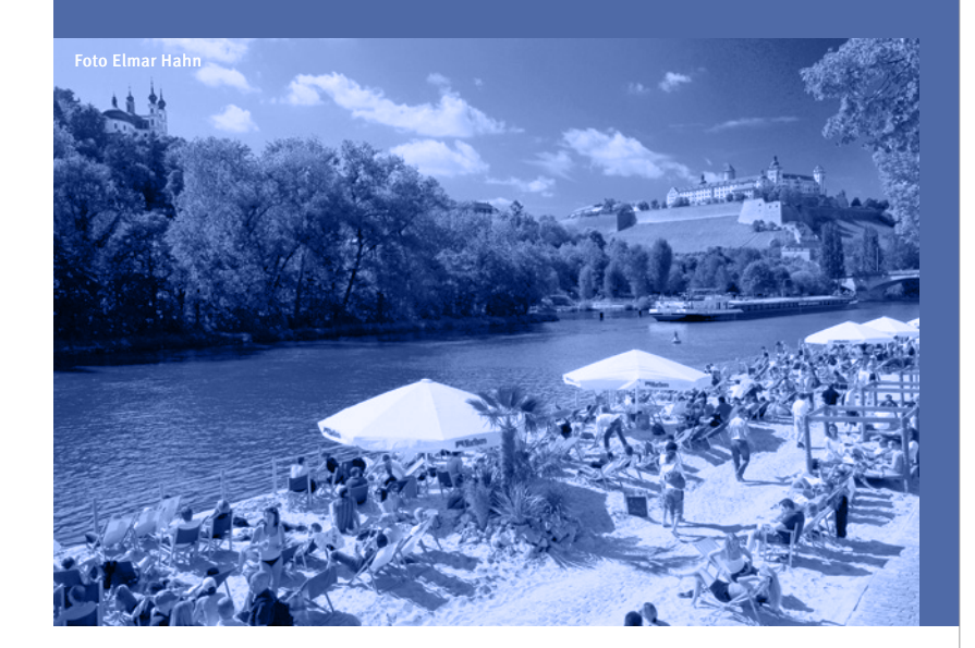
City Beach on the Main river with a view of the Marienberg Fortress

With approximately 250 degree programmes, the University of Würzburg offers all fundamental areas of study. Students receive excellent academic guidance and are encouraged to take part in research projects right from the start of their studies.